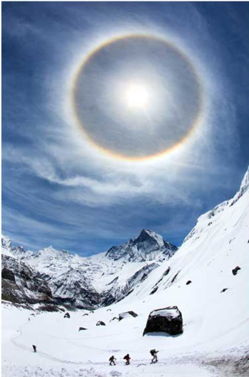
The World with Scattering